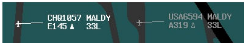
Figure 2. Data link capability indicators in the data blocks of owned (left) and unowned (right) aircraft.

data block for each departure aircraft that was data link equipped. The data link indicators appeared at both the ground and local control positions, but only the ground controller could issue or cancel a D-Taxi clearance. Aircraft that were data link equipped had an upright triangle that was either open grey (unowned) or filled white (owned). Only one controller position could own an aircraft at any given time (see Figure 2).