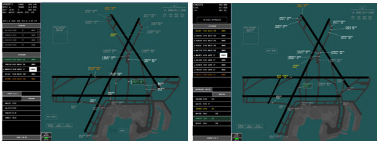
Figure 1. The TODDS ground (left) and local (right) control positions including FDEs, surface surveillance data, and weather information.

The TODDS consisted of two touchscreen displays, one for each control position. Each touchscreen had an active display area of 17" (43.2 cm) wide and 12.75" (32.4 cm) high with a 1,600 x 1,200-pixel format, and had a viewing angle of 85 degrees. Each touchscreen had an associated Airport Surface Detection Equipment – Model X (ASDE-X) keyboard and a trackball/keypad as additional input devices. The TODDS presented electronic flight data in the form of Flight Data Elements (FDEs), surface surveillance data – including aircraft position and associated data blocks – weather information, and the ability to construct and issue D-Taxi clearances. This integrated design placed all of the most important information on a single display for each controller position to simplify information presentation and to reduce the controllers' need shift their visual attention among multiple displays. Figure 1 presents screenshots from the TODDS ground and local control positions. For more information about the TODDS, see Truitt (2006, 2008).