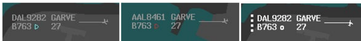
Figure 4. Data comm indicators in data blocks for a sent (left), failed (center), and accepted (right) D-Taxi clearance.